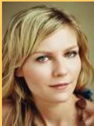
Kirsten Dunst Directs "Welcome"